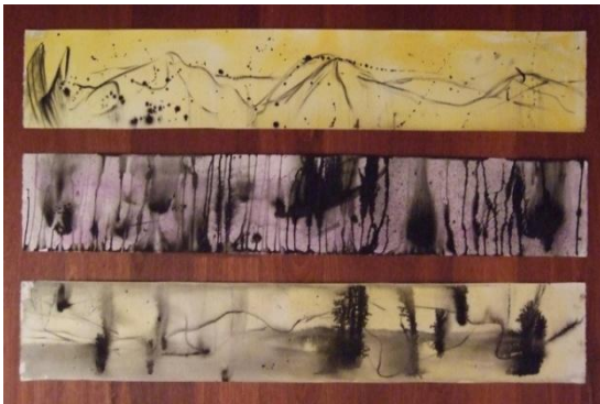
The Winda Woppa: Watercolour, ink on watercolour paper. In this triptych, she wished to portray the landscape around her family holiday house.